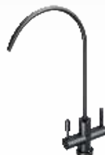
with black matt brass faucet